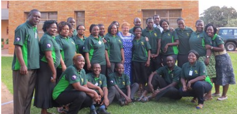
IHPCA team members with BSC PC year 2 students from different African countries after face to face training in August 2013

this diploma in Palliative Care or have successfully completed the DCPC, can enter the degree at year 2. The Bachelor's degree programme commenced in July 2010. The first BSc in palliative care for Africa was conferred in January 2013. This equips our colleagues in Africa with specialist knowledge, experience and status.